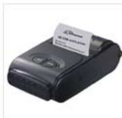
Option:Auto1/2/3 Track MSR