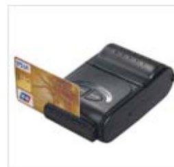
Option:Auto1/2/3 Track MSR