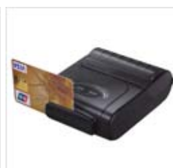
Option:Auto1/2/3 Track MSR