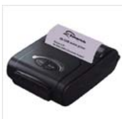
Option:Auto1/2/3 Track MSR